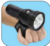
Goodman glove for hands-free operation